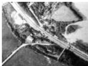
Aerial photo showing overhead pipeline taken in 1969