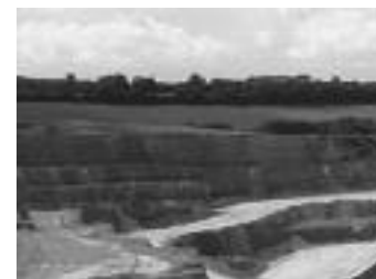
Kensworth Chalk Quarry, September 2008

transported by rail from Totternhoe to the Midlands for processing. In the 1960s diminishing reserves at the Totternhoe quarry, together with a need for the company to increase production and a national re-organisation of the rail network, made a radical overhaul of the business essential. Quarrying rights were obtained at Kensworth with reserves up to 80 years (see photo). But the location was on the top of the Dunstable Downs in an area of environmental importance with only minor road access. The only practical way of transporting the chalk was found to be by pipeline. It was the first enterprise of this kind in the country and has shown itself to be very successful.