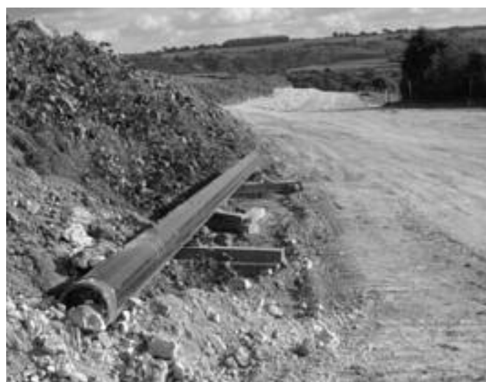
The trench has just been filled on Totternhoe Knolls. Photo Omer Roucoux October 2008

There were once several lime companies working quarries in the Dunstable area, but the last of these, Totternhoe Lime & Stone Co., closed at the beginning of 2009. Prior to 1964 crushed chalk was