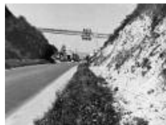
Chalk Hill Cutting slurry bridge, 1969