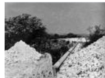
Chalk Hill slurry bridge, 1969