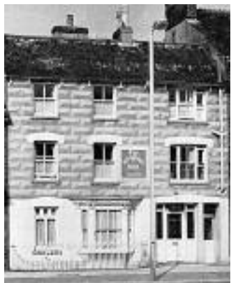
The Grey House 1965