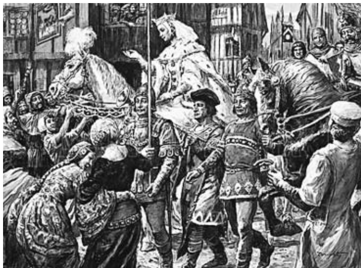
The English people welcomed the rebel army that Queen Isabella and Roger Mortimer led from France