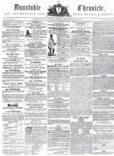
The Dunstable Chronicle and Advertiser which was published in June 1856