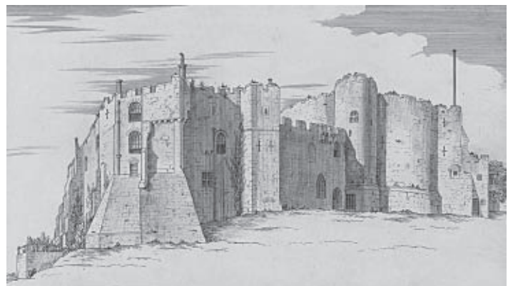
North East view of Berkeley Castle where Edward II was imprisoned and the attempt to free him was made