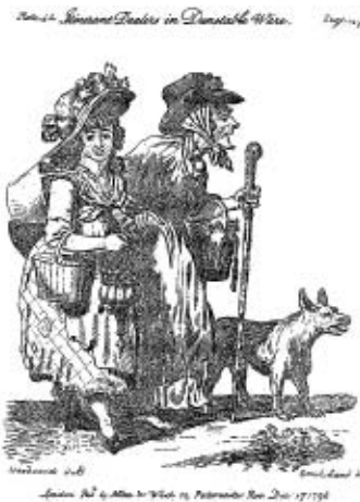
The engraving that was mistakenly described as 'Dunstable Straw Sellers' by George Cruikshank and was in fact by his father, Isaac Cruikshank, titled 'Itinerant Dealers in Dunstable Ware'

It seems quite clear that the reporter was confusing this with an engraving titled 'Itinerant Dealers in Dunstable Ware' which is dated 1796 and is held by the Beds and Luton Archives Service.