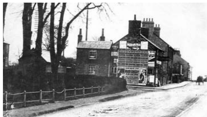
The Royal Oak in Church Street