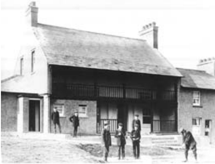
Teeing off in front of the old club house – circa 1910

A golf course in Dunstable was first mentioned in the Herts Advertiser in 1893: 'Arrangements are in place to form a golf club in Dunstable'.