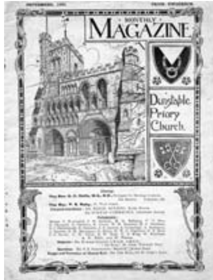
The September 1930 Parish Magazine