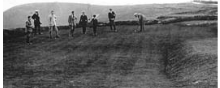
The 9th hole on the old course – circa 1930

the town and attract new residents and visitors was a scheme to establish a golf course on Dunstable Downs.