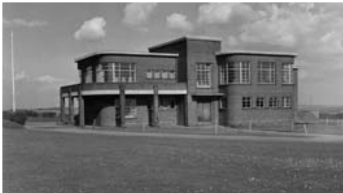
The new clubhouse which opened in 1936

In the July 4th, 1936, issue of Golf Illustrated , Britain's authoritative journal on golfing matters, reported: "Playing golf at Dunstable Downs was like playing on the top of the world" and it described the clubhouse as "an utterly modern clubhouse placed on very nearly the highest point of the course that drinks in every ray of sunlight and catches every whisper of the softest breeze". The author went on: "Never have I seen in this England of ours a patchwork quilt of fields of greater variety or more intense beauty."