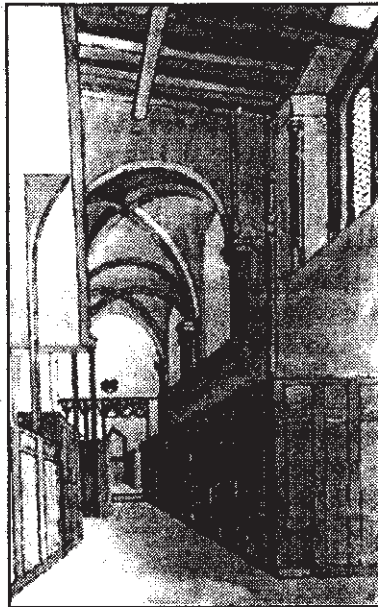
South aisle looking east drawn by T. Charles in 1838

So, in the second half in the 19 th century, the townsfolk of Dunstable had made good the neglect of the previous four centuries and found the money to pay for it. The Reverend Frederick Hose well deserves the words recorded on his commemorative brass in the north aisle of the Church :