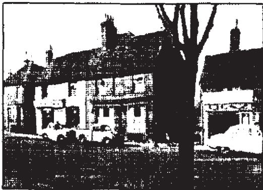
Nos. 16-20 West Street are amongst the 'Listed Buildings at Risk'. NPS Builders of Hemel Hempstead have now found that the structure is unsafe and have applied to South Beds council to demolish the whole building and reconstruct it to a similar appearance (Dunst. Gaz. 13 July 1994). This view shows its state in 1984. The house at the extreme left was demolished to make space for the Midland Bank. About 'Listed Buildings at Risk' see Joan's article on page 7.

Dunstable Larks were once famous. Our logo, for this issue only, shows the bird in full flight above the Downs. Did you know that a 'flock' of larks is actually called an Exultation of Larks ? More about these birds overleaf, page 6.