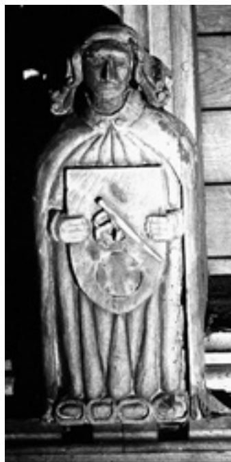
The figure of possibly the schoolmaster with the Dunstable Arms on his shield