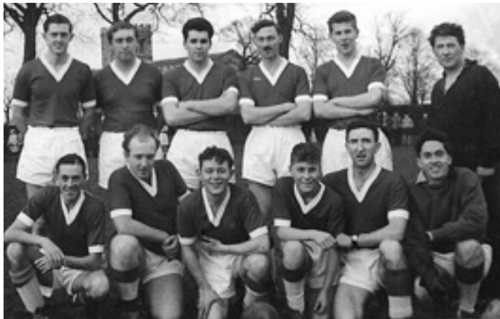
Britain Street staff football team in February 1960