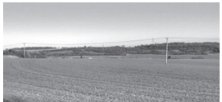
Is this the site of a massive battle where the Romans slaughtered an army led by the British queen Boudica? The view is from the hills near Kensworth quarry, looking towards Blow's Downs and the fields leading to the Manshead campus.