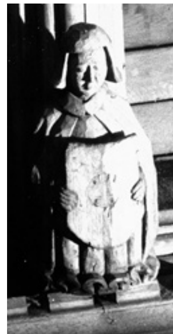
A smaller figure in different attire could possibly be a pupil