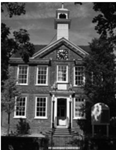
Chew's House today

on benches (forms) for most of their lessons, only sitting at desks when they were required to write. There were pegs for them to hang their caps on and a small cupboard for the meagre supply of books. The Master lived at the back of the building. There was also accommodation for a maid. The back yard contained the stables, a well and the latrine. The cellar originally had an earthen floor. Heating was by coke stoves but they were only used in extremely cold weather. The external doors were of oak and those inside were of deal. Two lead figures stood above the main door, showing boys in their uniform. Unfortunately, these were stolen in early November 1998 and replacements were made of fibre-glass. Initially, the building had no clock, Frances Ashton paid for this addition after the school had been open for a few years.