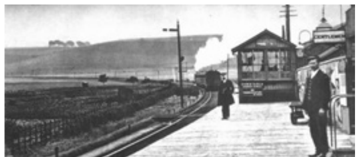
Dunstable Station at the turn of the 20th century showing Blow's Downs in the background – note the absence of scrub

The arrival of commercial chalk extraction in the early 20th century saw real change in the area. The Luton to Dunstable rail link, which opened in 1858, provided transportation of lime, after a railway siding was constructed at the quarry. The first indication of quarrying activities on Blow's Downs can be found on the 1901 Ordnance