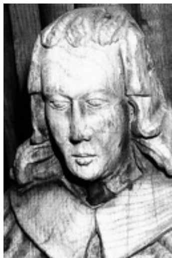
Detail of a beautifully carved face

They are about 70cm high and 30cm wide and are believed to date from the late 15th century when the roof was replaced. Wooden carvings are frequently found in the roofs of East Anglian churches, but these invariably take the form of angels and are known as 'angel roofs'.