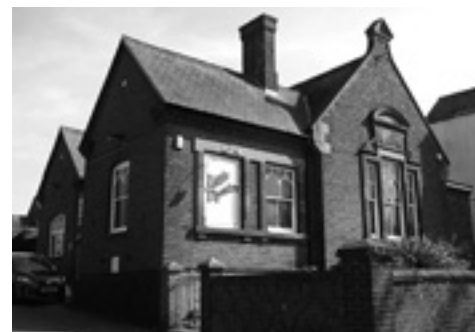
The new school which opened in 1883 which is now the Little Theatre

The County Council hired both buildings for educational purposes on either side of WWI, under the Settlement of 1910. The governing body comprised twelve members. Four were ex-officio – the Archdeacon of Bedford, the Prioress Rector and his two churchwardens. Two others were representative – appointed by the Town Council. The other six were co-optative, appointed by the ex-officio and the representative governors. This is still the make-up of the Chew's Foundation governors. The new school, now the Little Theatre, was used by children from nearby schools for woodwork and cookery. The original building was also much used by the Priory Church for youth work and by the Church of England's Men's Society. The income of the Foundation, after the maintenance of the building, was to be used for the educational benefit of poor families in the parishes of Dunstable, Houghton Regis, Kensworth and Caddington. At the beginning of the 20th century most of the income still came from farm rents and from the rent of land owned by the Foundation. During the next hundred years, these assets were sold off and the money invested in Government bonds. The sites of Watling School and Priory Middle School playing field are two examples of this.