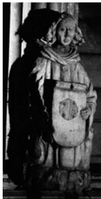
The figure with the large collar that is possibly the Chaplain

In 1442 a group of local burgesses founded the Fraternity of St. John the Baptist in order to employ a chaplain who would say masses and prayers for their souls and those of their friends, to run a school and to look after the poor. As there were no local wealthy landowners, it is thought that the Fraternity was most likely to have provided most of the funds for the replacement roof. Several wills dated around 1520 refer to money bequeathed for the purpose of repairing the roof, although it is believed that the replacement of the roof had been undertaken by the end of the 15th century, so perhaps these were just for ongoing repairs.