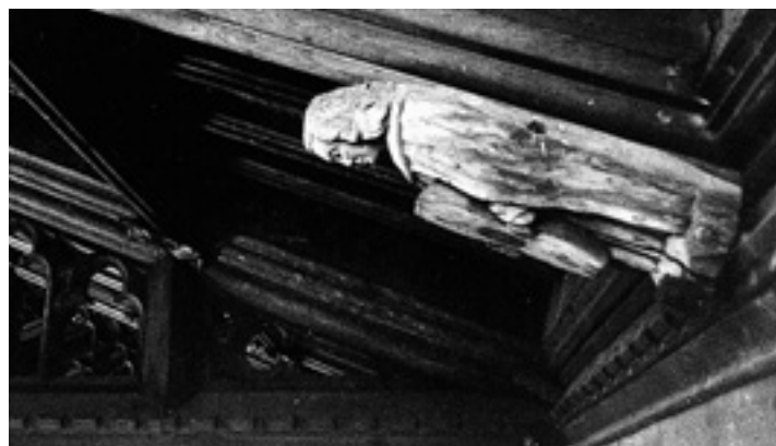
One of the roof figures showing the rafters

Since 1392 the nave had been used by the townspeople for their church services on the understanding that they maintained the structure of that part of the building and it gradually came to be regarded as the Parish church (as a result of this arrangement, the Church together with its roof and carved figures, escaped demolition following the Dissolution of the Monasteries in 1540).