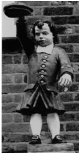
Chew's Charity Schoolboy

This year will see the tercentenary of the opening of Chew's Charity School, a building which is now called Chew's House.