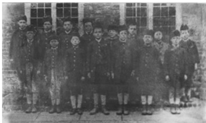
Photograph of Chew's 'blue coat' boys taken in 1879