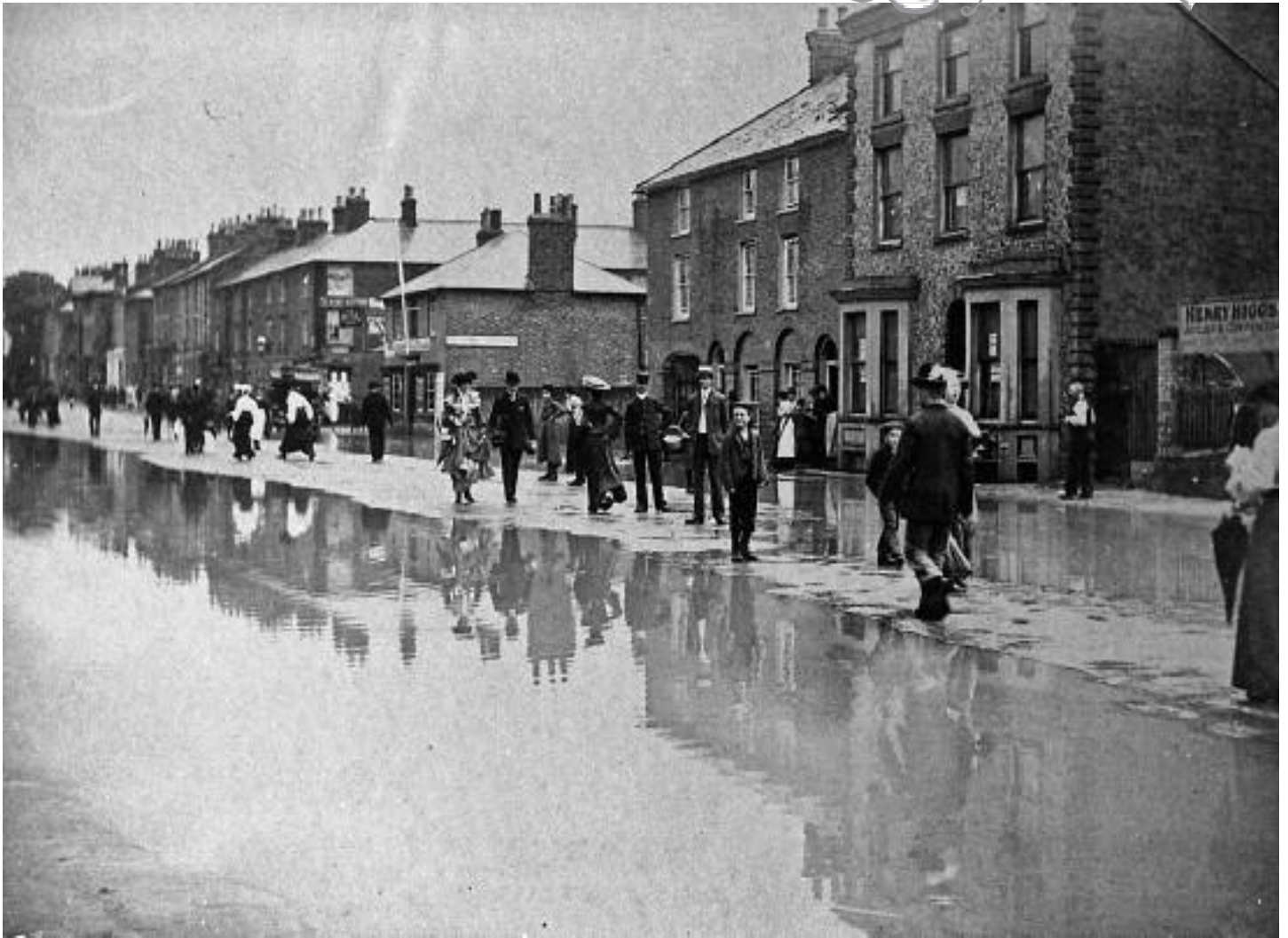
Reproduced from the Gazette, July 21st, 1893

THE STORM. —Yesterday (Tuesday) afternoon a thunder-storm, remarkable for the heavy deluge of rain which accompanied it, broke over Dunstable. The storm appears to have approached us from a northerly direction, and a singular feature was the course it took and the strict line of demarcation of the storm area. For instance, while Dunstable was flooded and the streets turned into swollen torrents, very little rain fell beyond the Half Moon Hill, while Whipsnade, Kensworth and Studham appear to have been untouched. A probable explanation is that the storm approached us, passing over Toddington and Chalgrove, where it is reported that a number of sheep were killed by lightning, and was turned in its course by the Chiltern Hills, swerving around and passing off in the direction of Leighton Buzzard. On all hands it is said that never before has such a deluge of rain been experienced in Dunstable. In an astonishingly short space of time streets became like rivers, while the flood poured over the kerbing and pavements and rapidly filled the cellars up to the level of the ground floor. Near the Grammar School, a remarkable sight was seen. The roadway for some distance was covered with a foot depth of water, while on either side the flood was pouring into the