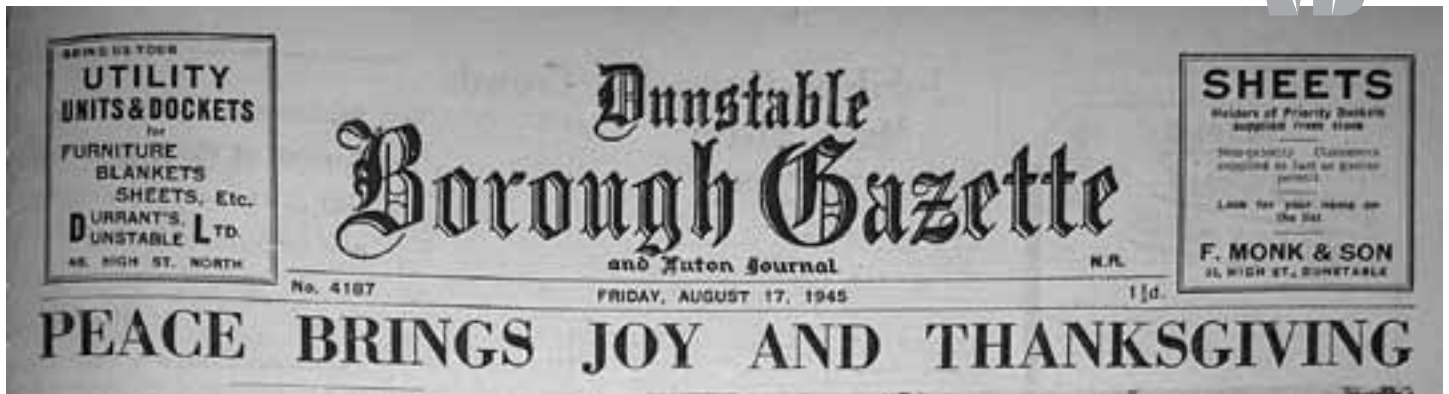
The 17 August 1945 edition of the Dunstable Borough Gazette, celebrates VJ Day

Dunstable people had mixed feelings during VE Day in May, 1945, when the Allied victory over Germany was celebrated.