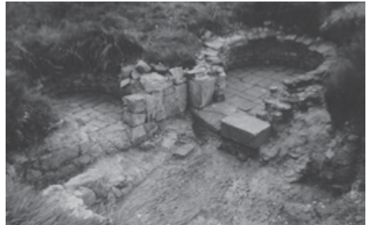
12/13th century 'behive oven' excavated at Friary Field in the 1960s