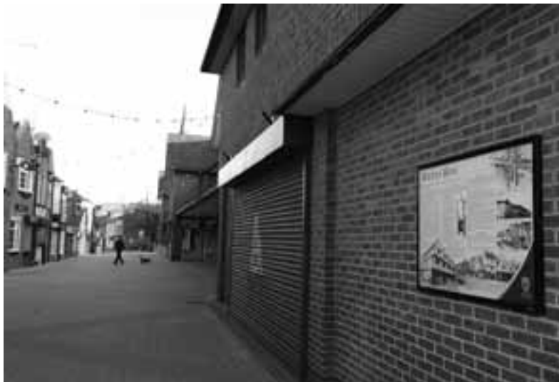
A deserted Dunstable with the new heritage panel shown on the right

I have been preparing an article for the Gazette and for this newsletter about the reaction in Dunstable to the surrender of Japan in August 1945. The first part of this is inside. Celebrations in Dunstable on VJ Day, and indeed on VE Day, were comparatively muted because of the particularly uncertain circumstances locally.