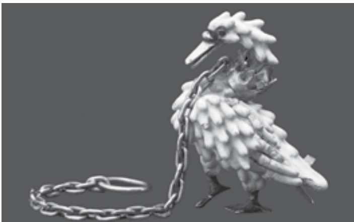
The Swan Jewel, now at the British Museum, was found at Friary Field in 1965