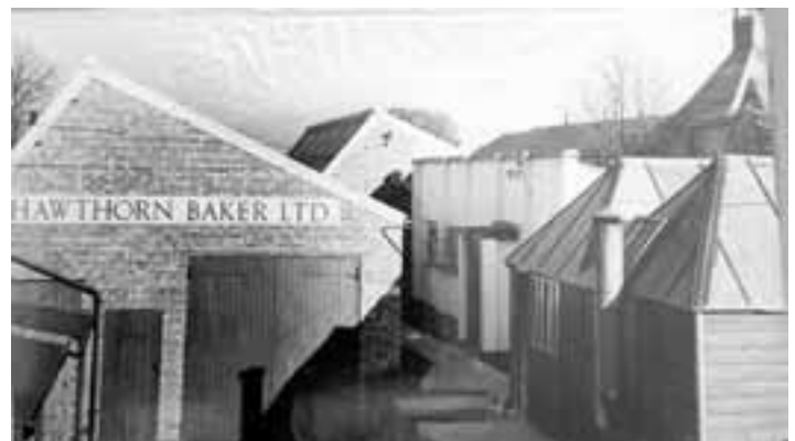
Hawthorn Baker's first factory in Nicholas Lane