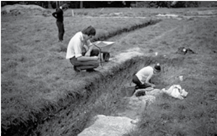
Excavating the Dominican Friary at Friary Field in the 1960s