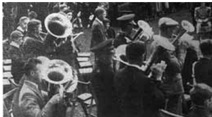
VJ Day service Grove House Gardens August 1945