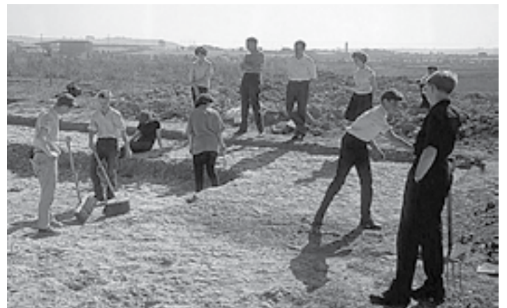
Excavating Saxon huts at Puddlehill in the 1960s