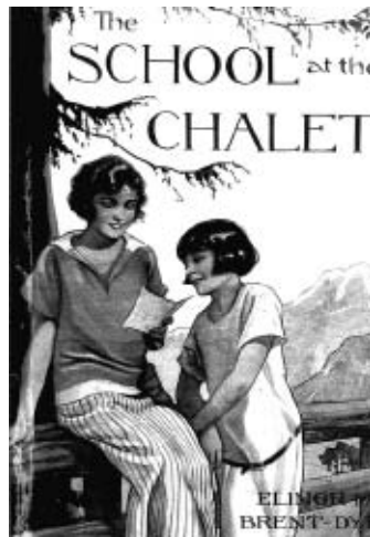
The first Chalet School book, was published in 1925

Miss Brent-Dyer's tales, set in an imaginary school in Switzerland, became hugely popular and she eventually wrote about 60 books about the adventures of the girls there. The stories, described by one critic as 'puzzling, silly, repetitious, unintentionally funny, pious, charming, peculiar...' are still in print.