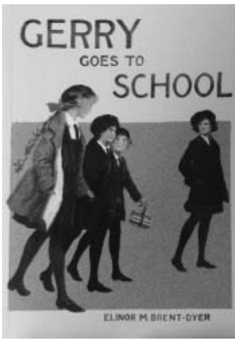
Elinor Brent-Dyer's first published novel was published in 1922