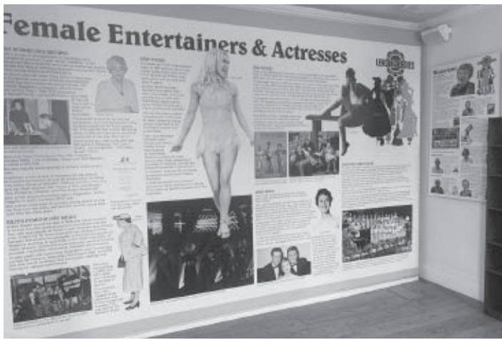
The Leading Ladies exhibition opened at Priory House in June