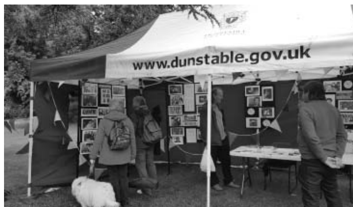
Queensway Hall of Fame at Grove House Gardens

So, her photos will be introduced at next month's meeting