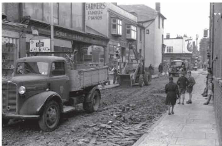
Church Street, before widening, with Farmer's music shop next to Gibbs and Dandy