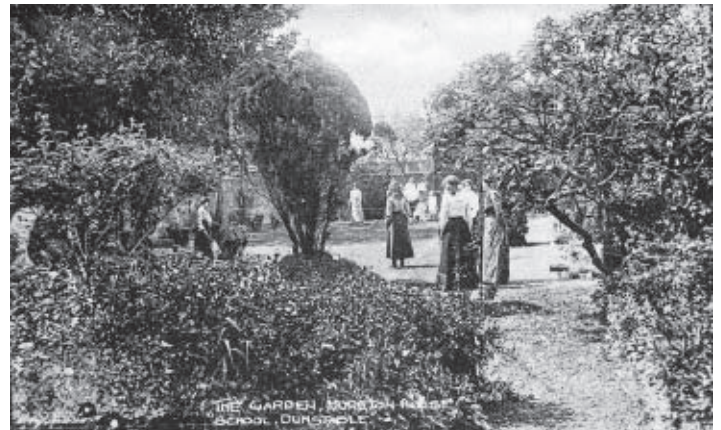
The garden at Moreton House School