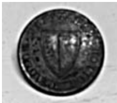
The uniform button at Kempston Police Museum

Unfortunately there does not appear to be any photographs of Dunstable police officers. Even Kempston Police Museum only has a uniform button.