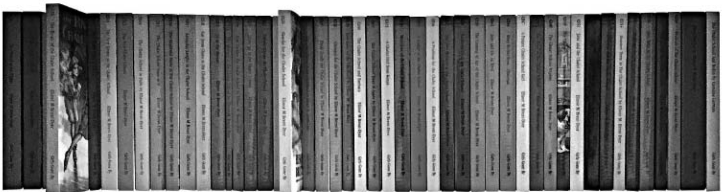
Below: The Chalet School books