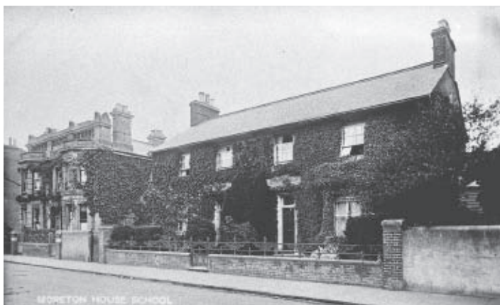
Moreton House School where Elinor Brent-Dyer came to teach in 1923