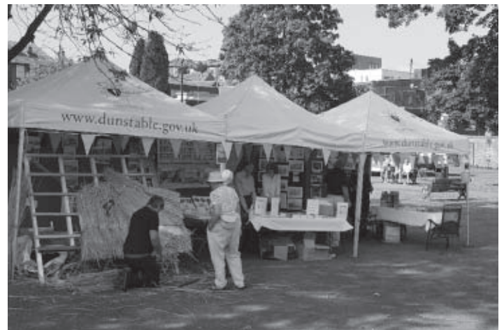
Archaeological Day at Grove House Gardens

Your society is part of the 'Cultural Consortium' set up as part of Dunstable's High Street Action Zone to encourage interest in the town's history. The quieter time during lockdown meant there were extra opportunities to research and write scripts for