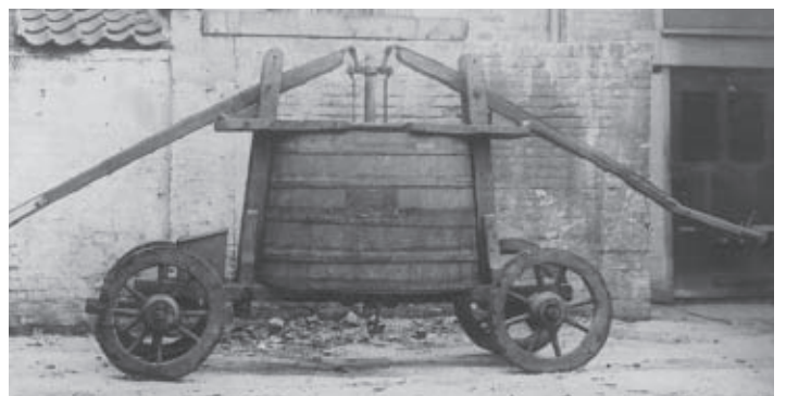
The original Dunstable fire engine which attended the fire in 1841 and proved ineffective at tackling the blaze. Now restored, it can be seen in the London Museum