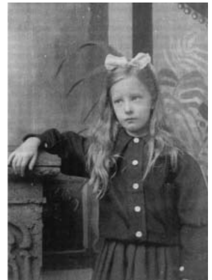
Elinor Brent-Dyer as a young girl